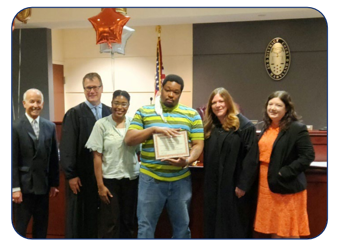
Figure 7: Judge Jack Lesser, Judge James Greene, DPP Agent Hidaya Hamilton, Baltimore City District MH Court Graduate, Judge Rachel Skolnik, and Judge Theresa Morse

In Maryland, as in other states, those with mental health disorder are increasingly becoming involved in the criminal justice system. Mental health courts were established in response to the increased numbers of individuals with mental health disorders found caught in the revolving door of the criminal justice system. See <u>Table 3</u> for a comprehensive list and basic information of all mental health courts.