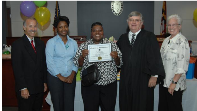
Baltimore City Mental Health Court Acknowledgement Party

The Mental Health Court still functions as a court under the authority of the judge. However, there are notable differences in the manner in which the court oversees cases. The central difference between these “problem-solving courts” and “business as usual” court settings is largely seen in the specialized and intense nature of the court’s oversight of cases and its collaboration with other public agencies to adjudicate and monitor those cases.