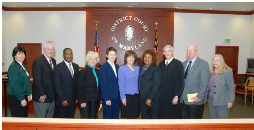
Howard County DUI/Drug Court Team with Orioles Great, Scott McGregor

Juvenile drug court program produced a 23% reduction in arrest rates and a 22% reduction in the number of new arrests over 18 months (from program entry). The average graduation rate for the juvenile programs was 53%. Their reduction in positive urinalysis tests was 69%.