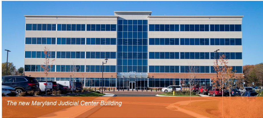
The new Maryland Judicial Center Building