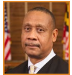
Judge Charles H. Dorsey, III Circuit Court for Baltimore City