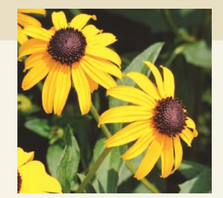
Maryland state flower Rudbeckia hirta, "Black-eyed Susan"

I consider myself a lucky person because I get to work with the people who appear before me to try to solve some of life's everyday problems in conjunction with all of the people who work in the family court. They include the Clerk of the Court's staff, the judges and their staff, the family services coordinator, the Department of Social Services, sheriff's department, the Department of Juvenile Services, and all other agencies connected to the court. Everywhere I have worked I have had the privilege of working with supercompetent, efficient people who make going to work a joy. I could not have survived without the support they have provided and continue to provide for me.