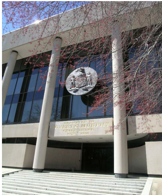
Robert C. Murphy Courts of Appeal Building Annapolis, Maryland

The following tables provide a statistical delineation of the Court’s workload for Fiscal Year 2010.