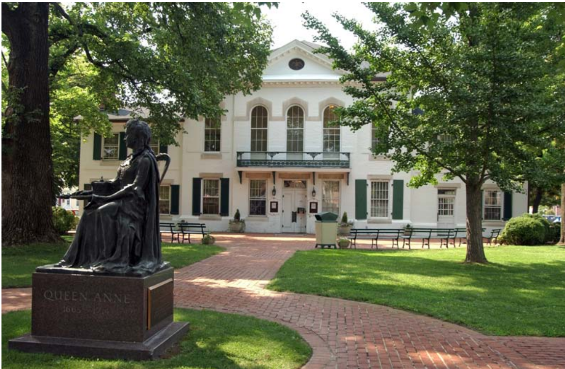
Circuit Court for Queen Anne's County

The following tables provide a statistical depiction of the workload in the circuit courts for Fiscal Year 2010.