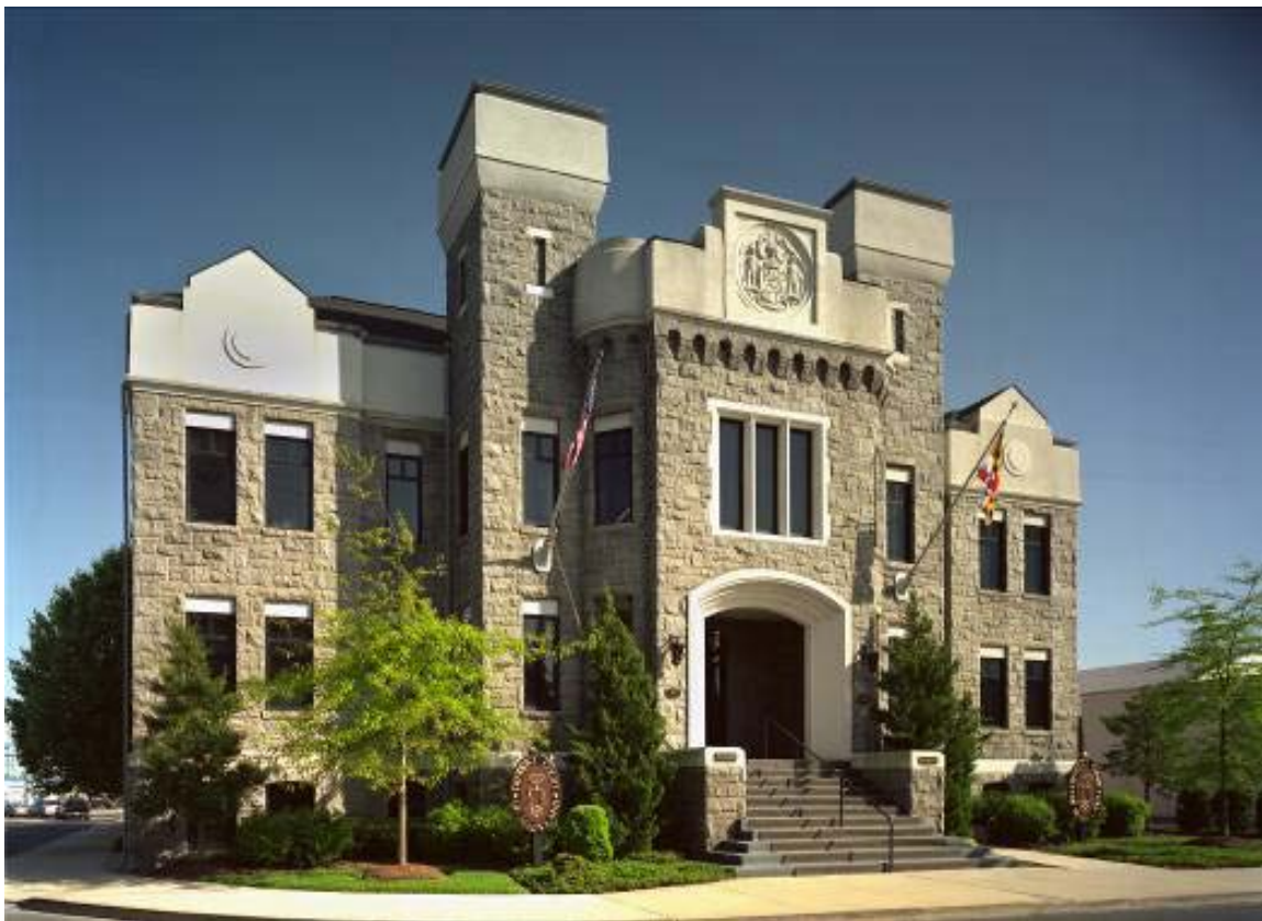
District Court of Dorchester County - Cambridge

The following tables provide a statistical representation of the workload for Fiscal Year 2010 in the District Court.