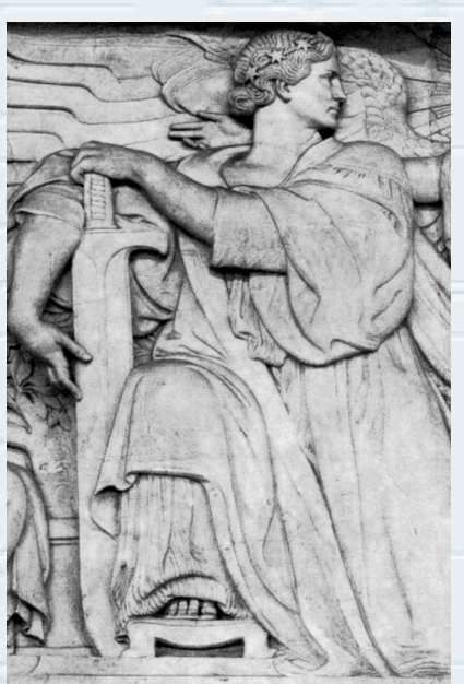
<u>What's Next:</u> The Committee plans on making recommendations to the Judicial Council by the end of the year.

Some of the issues being discussed by the Committee include current practices and procedures for assigning interpreters, the need for standard operating procedures for both the circuit courts and the District Court, and the translation of court forms into certain languages.