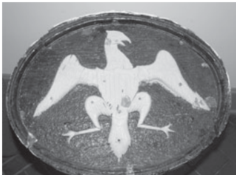
18th century eagle.