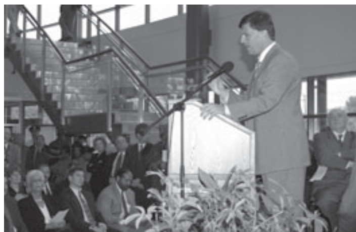
Governor Robert L. Ehrlich, Jr. participates in dedication.