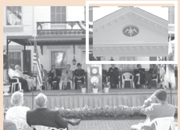
The new eagle was officially unveiled during a ceremony by Governor Ehrlich and Chief Judge Bell. Approximately 250 people attended the event outside the historic courthouse.

crafted wooden eagle represented truth and justice within the walls that it oversaw. Still strong in stature, but weathered by the elements and Father Time, the eagle was finally brought into the courthouse earlier this year and retired to a showcase in the main hallway of the courthouse. At a dedication ceremony in April, a gold leaf exact replica of the eagle was presented and placed atop the courthouse.